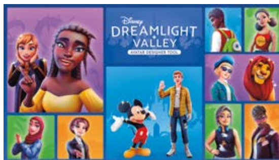
Avatar Designer, Gameloft. All rights reserved

In 2022, Gameloft's revenues reached an all-time high of €321 million, up 21.2% compared to 2021 (+19.4% at constant currency and perimeter). This strong increase is the result of Gameloft's strategic shift towards Console-PC-Mobile multi-platform games and the success of Disney Dreamlight Valley , launched in September 2022 simultaneously on Nintendo Switch, PlayStation 4 and 5, Xbox One and Series X/S, Steam, Epic and Microsoft Store. Console and PC represented 28% of its revenues in 2022. In 2023, more multi-platform games positioned as GaaS (game as a service) will be released by Gameloft studios.