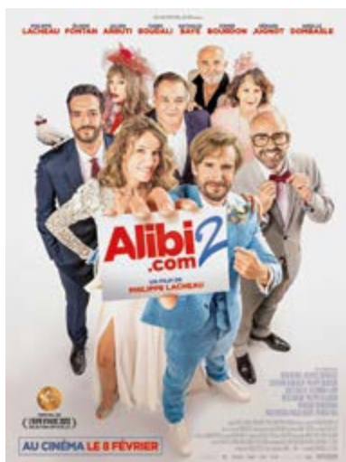
Alibi.com 2

As new subscriptions are primarily motivated by cinema, Canal+ gives it more prominence than ever before.