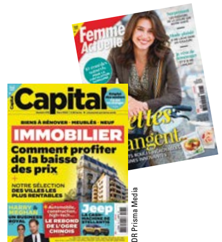
DR Prisma Media

(1) Vivendi has fully consolidated Prisma Media since June 1, 2021.